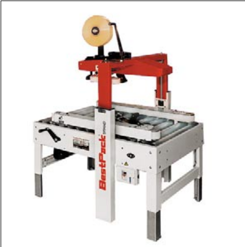
MSD22 Manual Side Drive